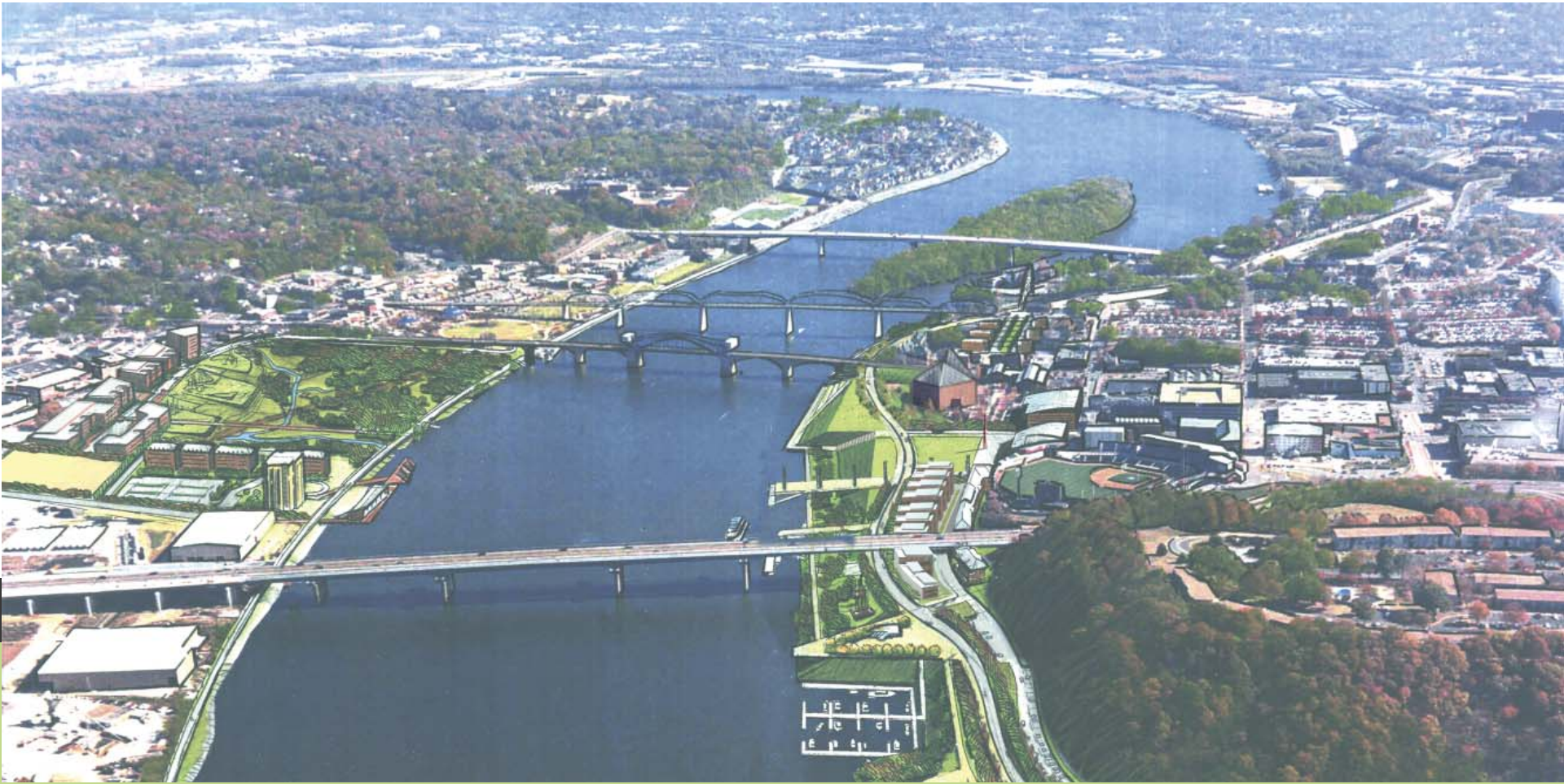
Upriver Aerial View