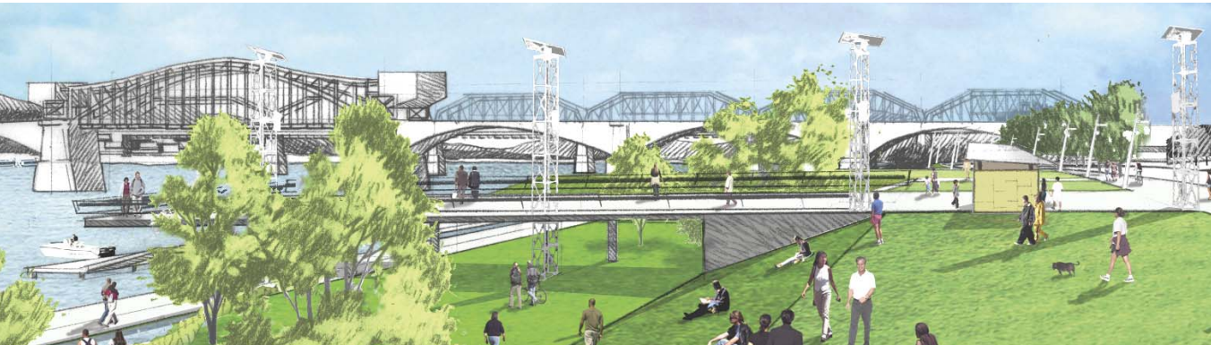
The Chattanooga Green at Ross's Landing