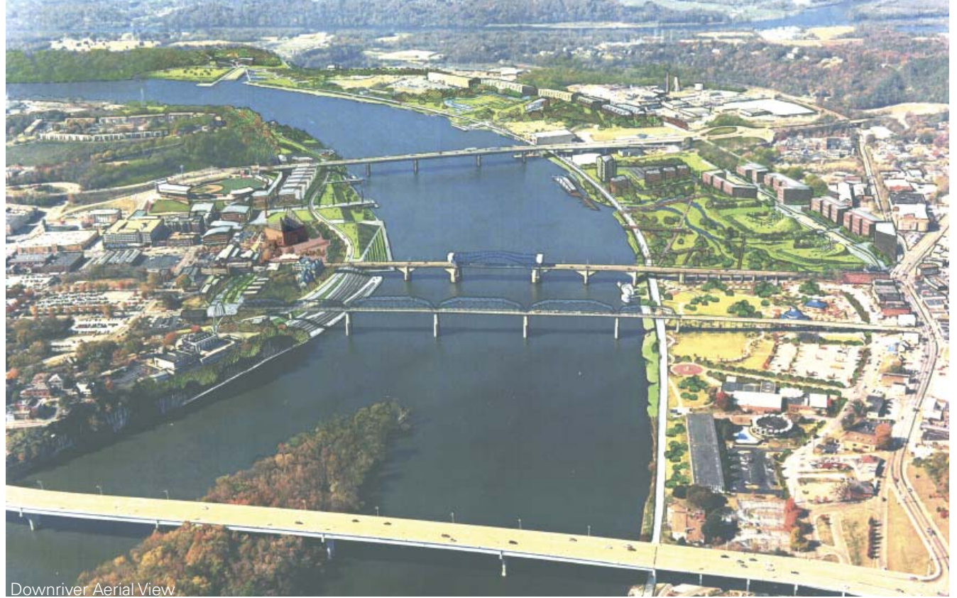
Downriver Aerial View