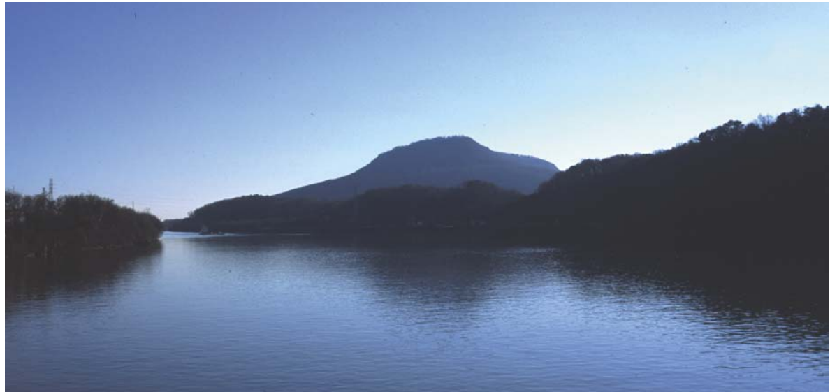
Tennessee River to Lookout MT.