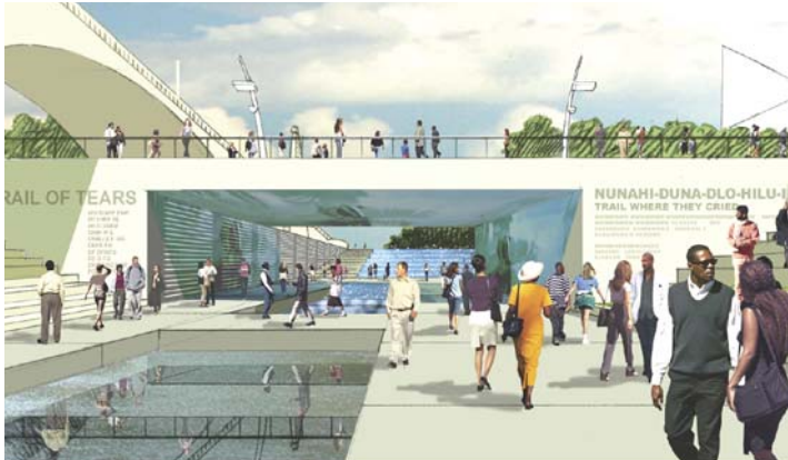
Trail of Tears at Ross's Landing