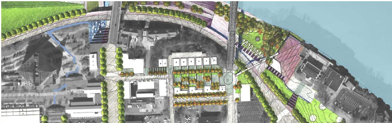
First Street Plan