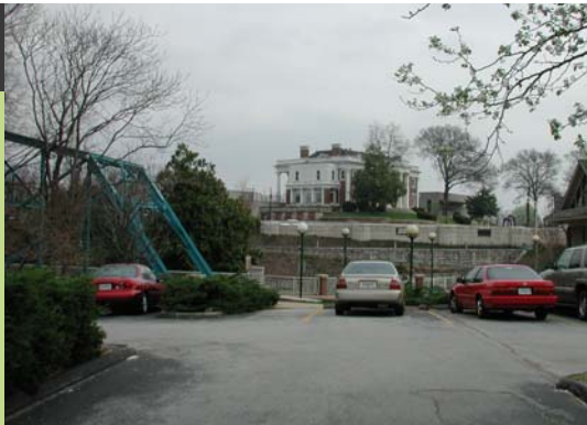
First Street Steps