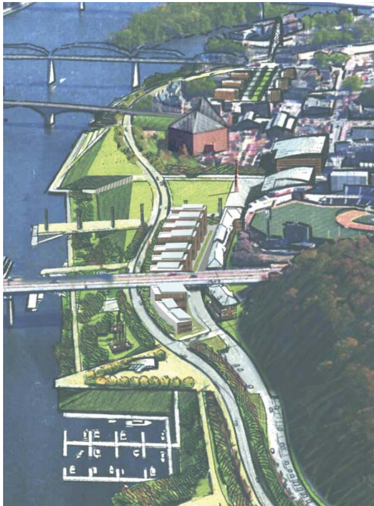
Ross's Landing Park

The revitalization of Ross's Landing Park is a cornerstone of the plan. Here at the birthplace of the city, the vision includes a reconfigured Riverfront Parkway allowing for an enlarged and enhanced riverside park. This expansive area encompasses the Chattanooga Green and the Tennessee River Terraces and will be a fabulous and functional setting for riverside festivals. The trailhead of the Trail of Tears is honored, and much-needed docking facilities accommodate transient boaters.