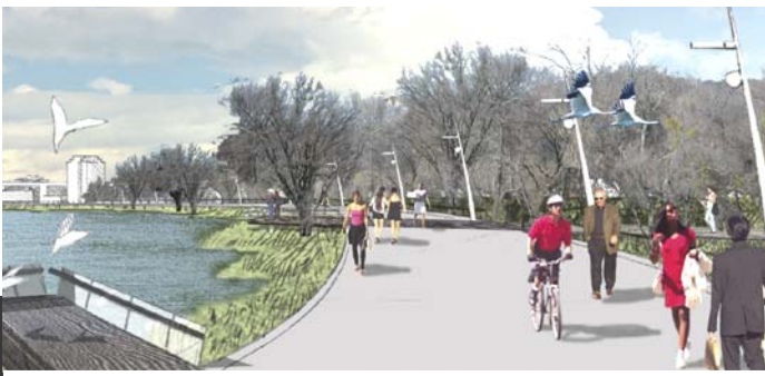
Tennessee Wetland and Riverwalk