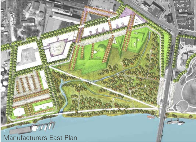
Manufacturers East Plan