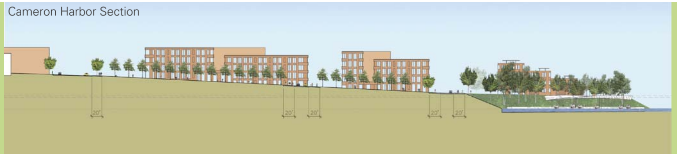
Cameron Harbor Section

Highlights of the remaining segments include: Cameron Harbor – anchoring the west end of M. L. King Boulevard with a marina, housing and offices, restaurants and shops, green space and a river taxi linking to the developments upriver and down; Manufacturers West – celebrating the industrial character of the river’s north shore, but tempering it with riparian habitats, riverwalk segments and a canoe launch; Moccasin Bend Gateway – providing a interpretive center, water taxi access and celebratory gateway into the Moccasin Bend National Park, pending the declaration of park status.