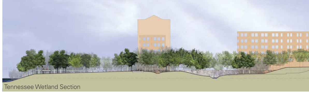
Tennessee Wetland Section